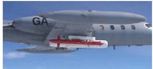
Designed for use with air-to-air and surface to air missiles