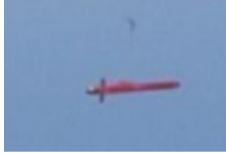
Target released and executes pre-programmed, multiple way point GPS navigation during free flight