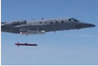
Target reel out at 220 KIAS